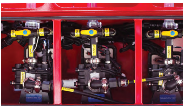
Easy access to DCI modules for calibration.