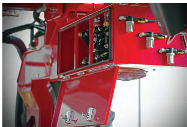
DCI enclosure specifically designed for convenience and protection.