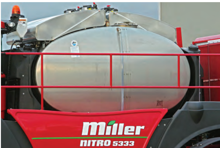
Up to 3 x 250 litre rotatorially moulded polyethylene tanks saddle mounted to product tank.